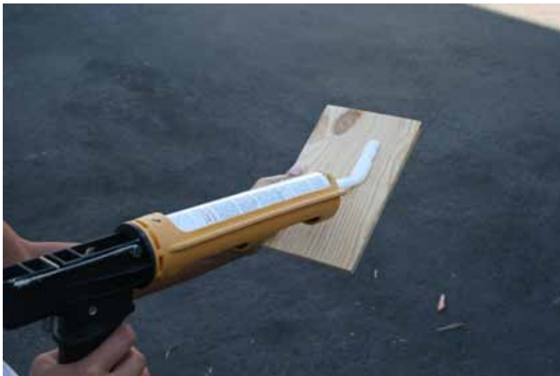
Applying the Caulking to the inside of the plate

Load the 10 oz tube of 5200 in a caulking gun, 4 or 5 large beads of caulking is recommended for good bonding. We like to do one backing plate at a time.