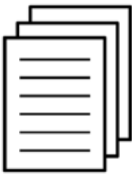
Installation Guide 1x