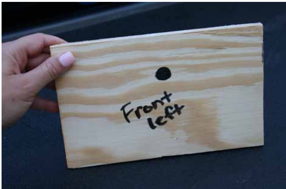
Marking the plates

Once your Aerial tower is installed remove the nut, split washer, and large washer. Take your 4 backing plate pieces and label them front right, front left, rear right and rear left. Using your flash light check the underside of where the tower is mounted to make sure that you will not sandwich any wires. Using the backing plate try to center it the best you can on the all thread from the tower foot and mark it with the sharpie. (Repeat for all 4 plates)