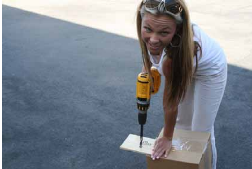
Drilling the Backing Plate

Use a 5/8 in drill bit, to drill through the backing plate. Dry fit each plate to make sure that they will fit after drilling.