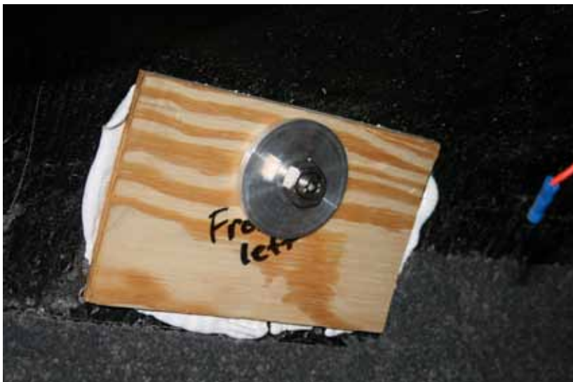
The backing plate completely installed

The caulking side will bond to the hull/ under side of you boat. So now the order will be the plate, large washer, the split washer and then the nut. For starters just get it snug, after getting all 4 in place go around and tighten them. Some card board will work great to clean up the excess caulking that will ooze out the plate. The caulking will set up in a couple of hours and will cure in 24 hours. The painter thinner or lacquer is nice to have in case you need to do any clean up (hands or your tools)